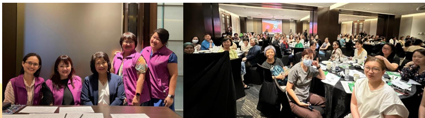
Photos taken at the CGM Workshop.