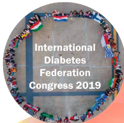
Samantha (see Singapore flag) representing Singapore at the YLD Training Summit.