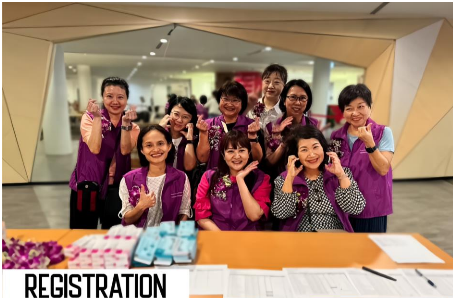
Committee Members at the AGM registration table.