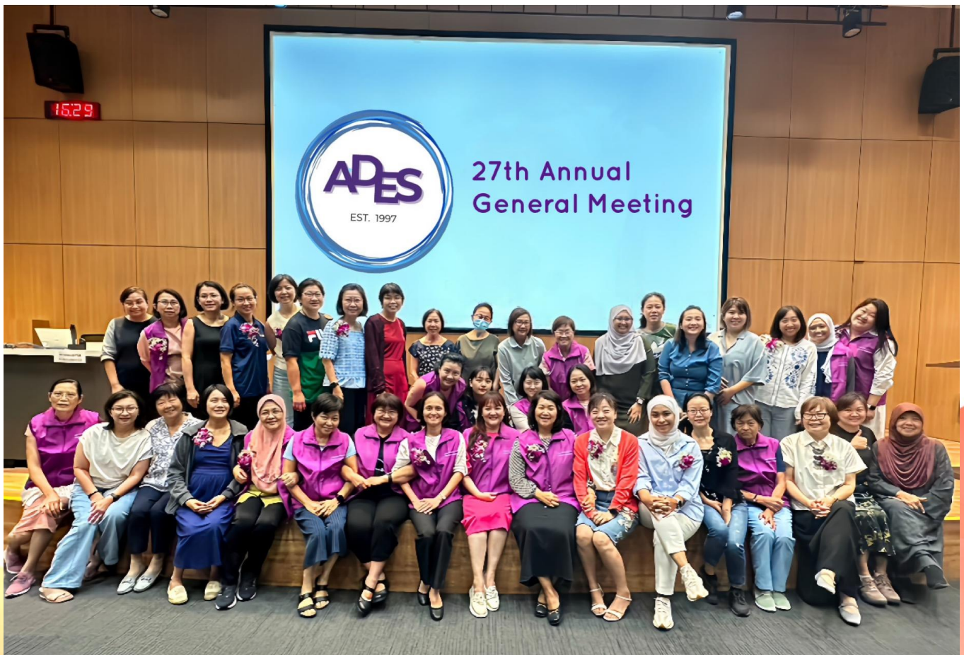
Some of the ADES members at the AGM.