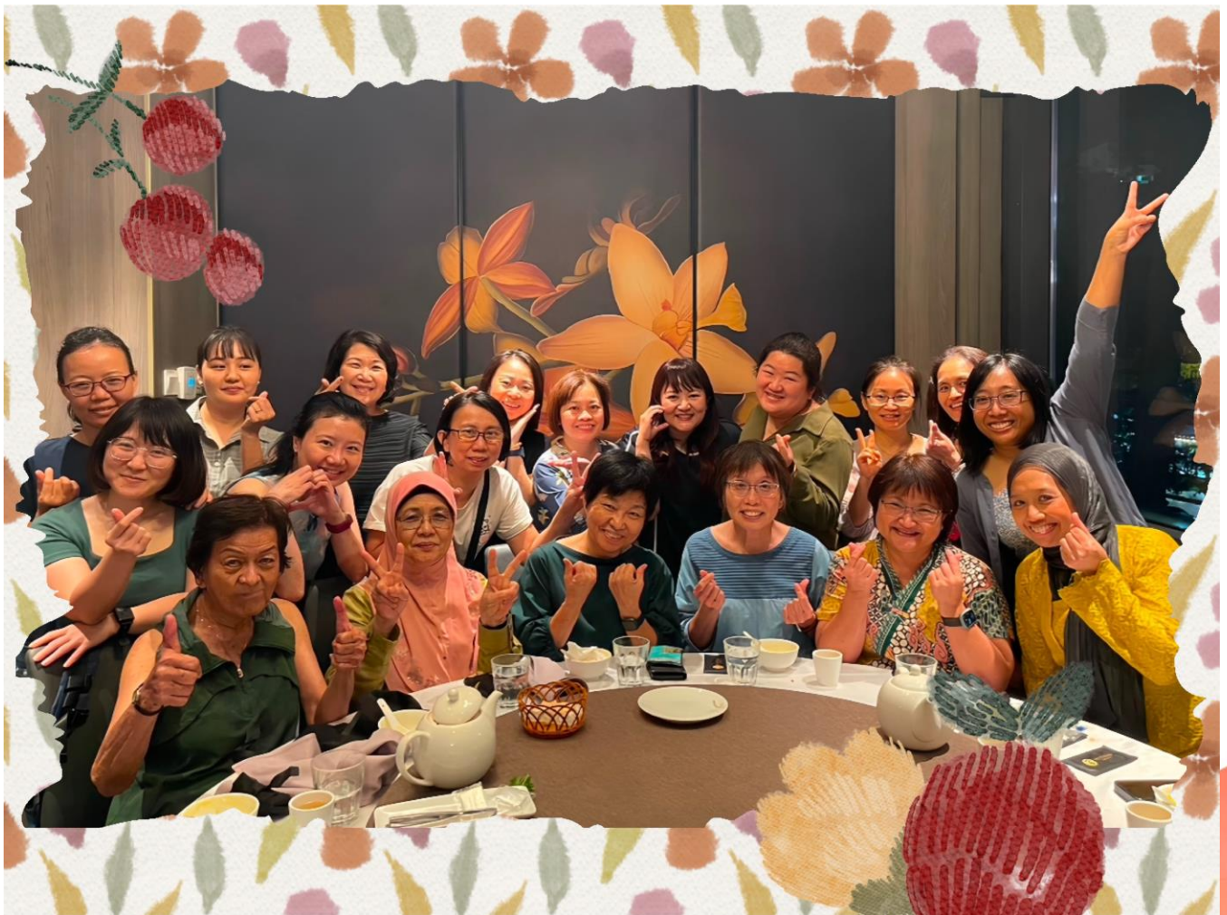
ADES Committee and Sub-Committee Members at the ADES year end dinner.

We look forward to connecting with you at our events and hearing your thoughts and feedback!